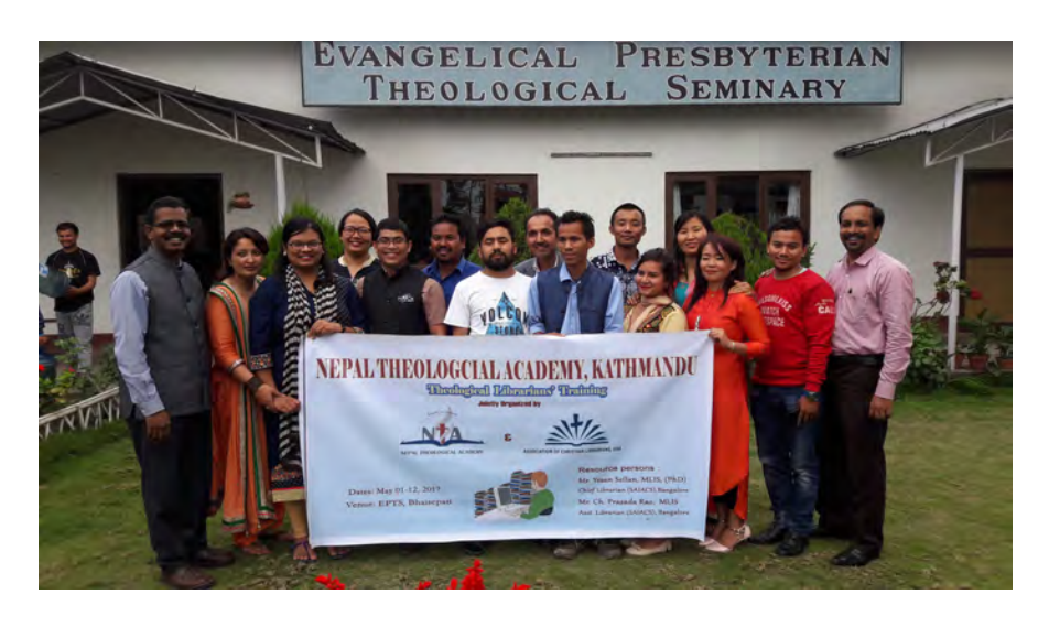
Image 5: First Nepal Theological Librarians' Training in Kathmandu, Nepal in 2017.