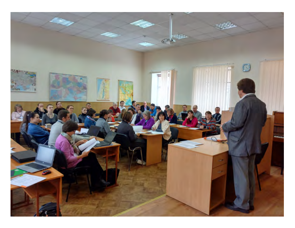
Image 6: The meeting of Eastern European theological librarians in 2019 in Kiev organized by EEAA.

cooperation with running an annual conference, training sessions for Koha, maintaining a discussion list on social media (Viber and Facebook), and some informal resources exchange.