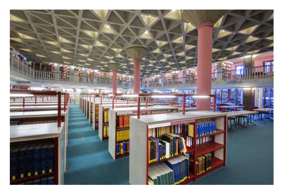
Image 2: Archbishop's Diocesan and Cathedral Library in Cologne, Germany

preservation and restoration. In countries such as France, where there is a strict separation of church and state, theological libraries cannot receive funds as theological libraries; they have to be organizations outside of the church. However, sometimes a theological library can receive grants for a particular project for which a public library or an institution has an interest (conversion of catalogs, digitization of collections, etc.).