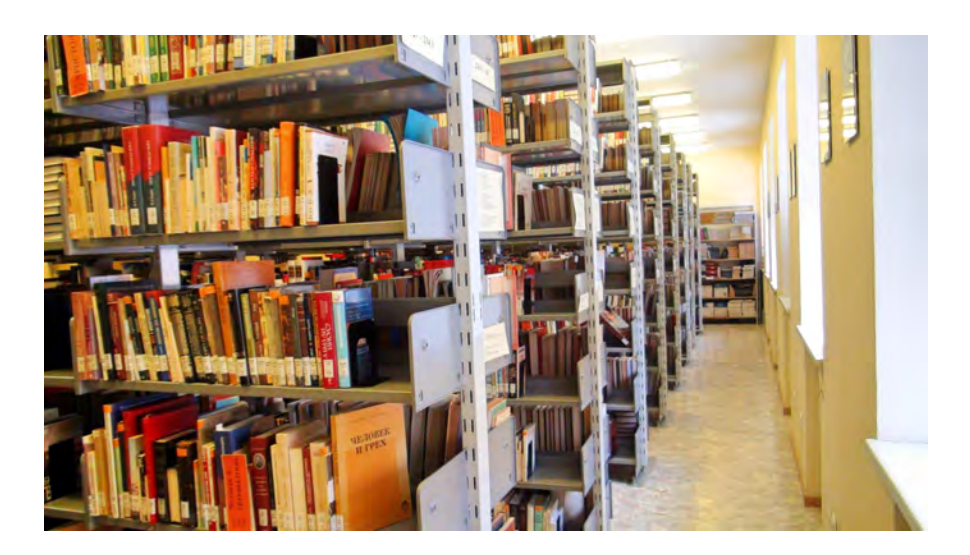
Image 1: The library of the St. Petersburg Christian University.

developed an extensive theological library of currently well over 70,000 volumes and just under 10,000 periodicals.