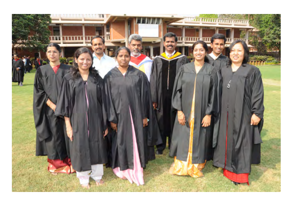
Image 4: First generation of Certificate in Theological Librarianship graduates in 2012 at SAIACS.