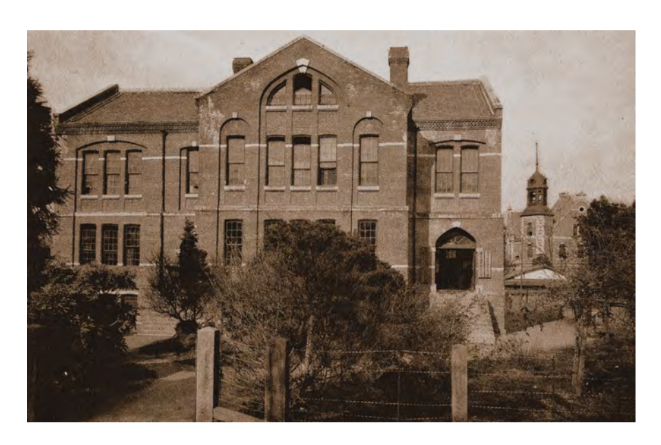
Image 4: The first library of Doshisha University (1914).

of the Central Library. Otherwise, as one of the research organizations, there is Kirishitan Bunko Library. This was founded in 1939 "with a mission to advance the study of the history of Kirishitan (early Japanese Christians) and the study of cultural exchanges between Japan and Europe." This library has more than 15,600 books in various languages.