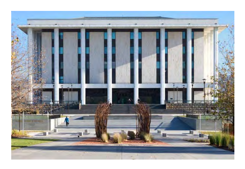
Image 2: National Library of Australia in Canberra.

are custodians of collections that range from smaller seminary or denominationbased libraries through to large multi-campus university, state, and national libraries.