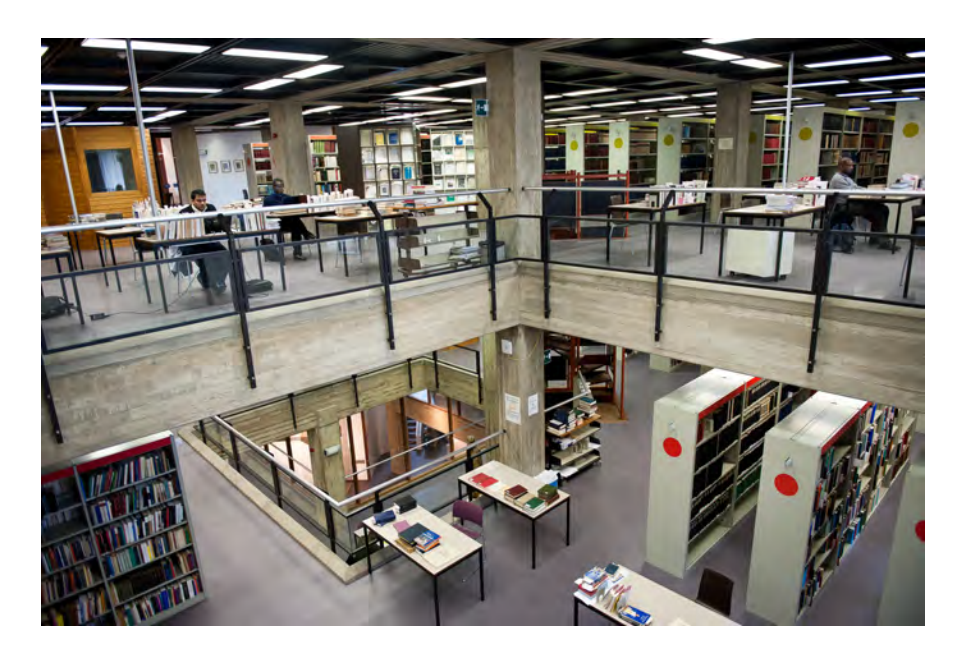
Image 3: Maurits Sabbe Library of the Faculty of Theology and Religious Studies, Catholic University in Leuven, Belgium