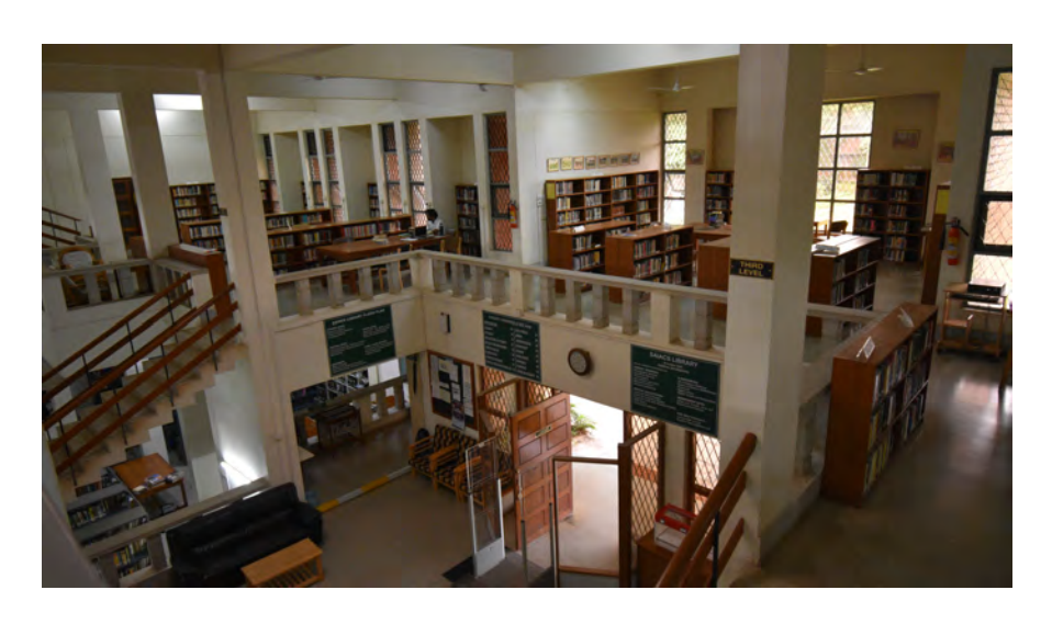
Image 2: The library of the South Asia Institute of Advanced Christian Studies (SAIACS).

The beginning of the 20<sup>th</sup> century was very important in the life of Protestant theological education in India, as it saw a revival that contributed to its growth and development. The need for higher theological education was fulfilled by the founding of the United Theological College (UTC) in 1910 with the support of the London Missionary Society, the Wesleyan Methodist Missionary Society, and the Arcot Lutheran Reformed Church in America. Later on, Leonard Theological College (LTC) in Jabalpur was founded with the support of the Methodist Church in 1922. In 1937, the World Gospel Mission, a holiness faith mission from the USA, founded South India Bible Institute, an interdenominational seminary, at Bangarapet.