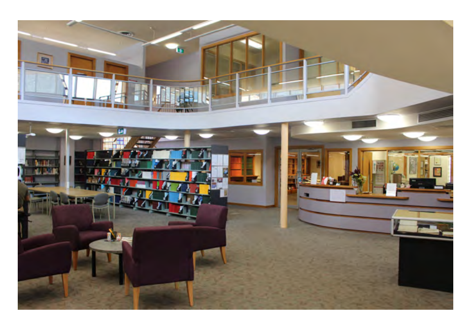
Image 1: Mannix Library, Catholic Theological College, University of Divinity, Melbourne, Australia.

Australian College of Theology,<sup>5</sup> and the Sydney College of Divinity.<sup>6</sup> Other similarly named consortia of theological schools in Australia have also been established in Adelaide,<sup>7</sup> Perth,<sup>8</sup> and Brisbane,<sup>9</sup> as well as in Auckland,<sup>10</sup> New Zealand. Such consortial arrangements have often been inspired by a spirit of ecumenism.<sup>11</sup> These partnerships have provided members with enhanced collaborative and resource-sharing opportunities and staff and students with access to a wider range of library resources.