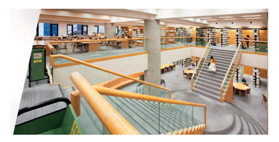
Image 5: Central Library of Sophia.