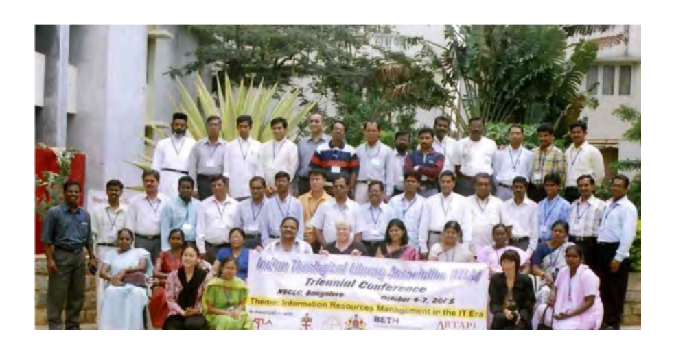
Image 7: Triennial Conference of ITLA held in Bangalore, October 4-7, 2005.

three times a year. The JLC has launched its union catalogue online (<a href="http://jlcbangalore.in/">http://jlcbangalore.in/</a>), which holds over 200,000 bibliographic records from Bangalore libraries.