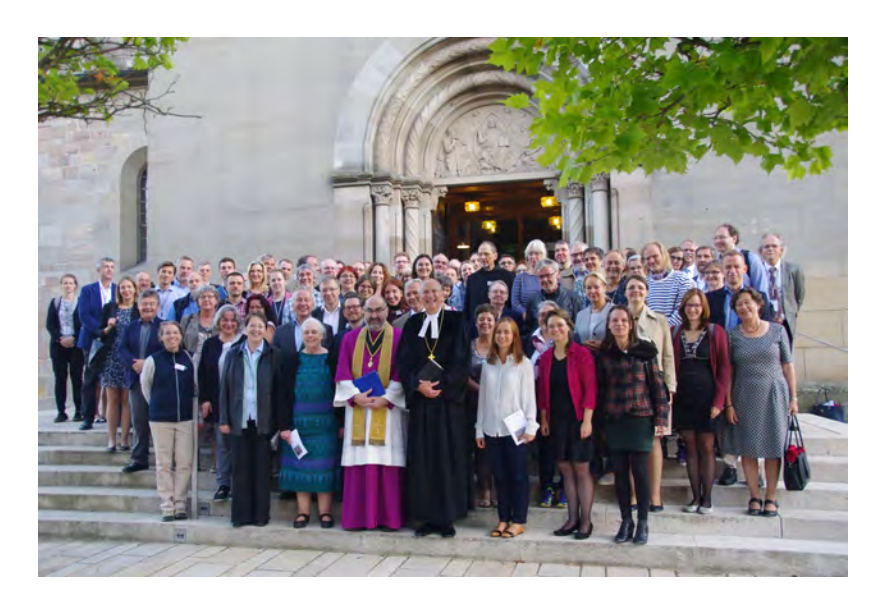
Image 4: Members of BETH and the two German theological library associations, AKThB and VkwB, at their joint meeting in Heilsbronn in 2018.

which is to help people, notably children, of different origins to learn about one another's religion by creating a Cartonera book together. Many European librarians and library associations were and are still involved in the work of RELINDIAL. It is hoped that the important work which has begun will continue successfully in the future.