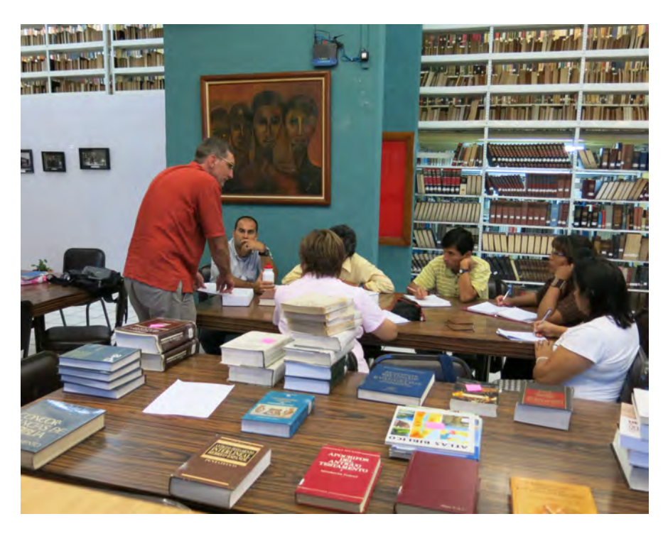
Image 1: Library of the Latin American Biblical University in San José, Costa Rica.