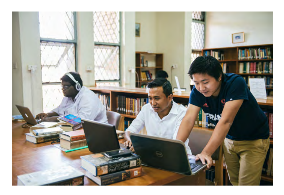
Image 3: Users in the library of the South Asia Institute of Advanced Christian Studies. (SAIACS)