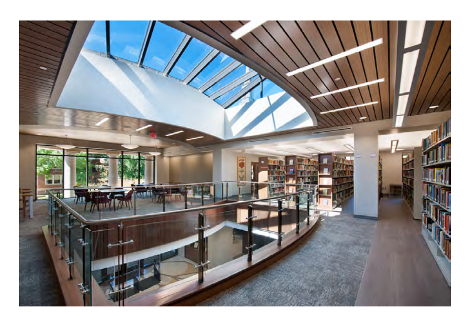
Image 2: Barbour Library at Pittsburgh Theological Seminary, USA.