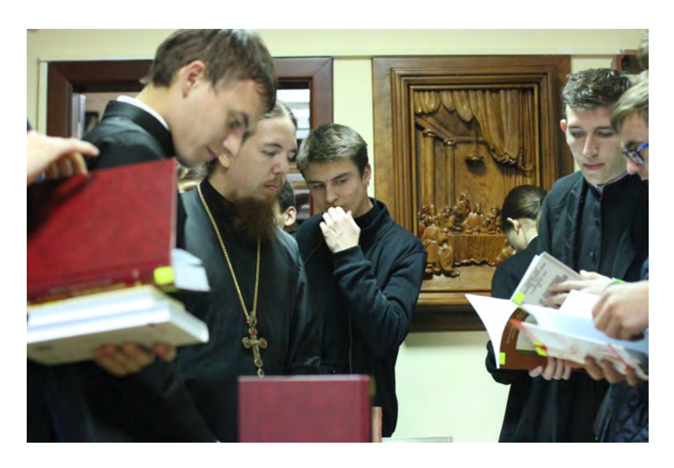
Image 3: Librarian at the Kiev Orthodox Academy and Seminary consulting future priests.

As Ukraine always was a spiritually alert area with high numbers of Christians in all denominations, the current scene of theological libraries in Ukraine is much more denominationally diverse.<sup>3</sup> The second-largest religious community, the Ukrainian Greek Catholic church, established formal theological training in 1783. In 1929, the Seminary was transformed into the Greek Catholic Theological Academy. This also marked the beginnings of the library of the Ukrainian Catholic University, its current successor and flagship institution. During the Second World War much of this library was destroyed and so, in 1995, with help from Rome and other places, a new beginning was necessary. The library today holds 146,000 book titles (not all are theological, as the university offers programs in various disciplines), 2,600 periodicals, and several special collections. Besides the University, there are several Greek Catholic theological seminaries, mainly in western Ukraine, with small theological libraries to support priest training. The Roman Catholics have four times fewer members and their own small seminaries with minimal libraries.