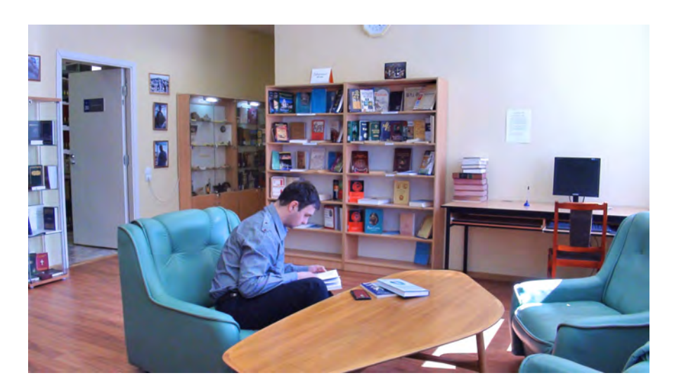
Image 2: Reading area at the Library of the St. Petersburg Christian University.

In Belarus, Protestant theological schools are primarily found in the capital Minsk: a Baptist seminary with a library of 12,500 volumes and a Pentecostal seminary; their holdings are around 15,000 volumes.