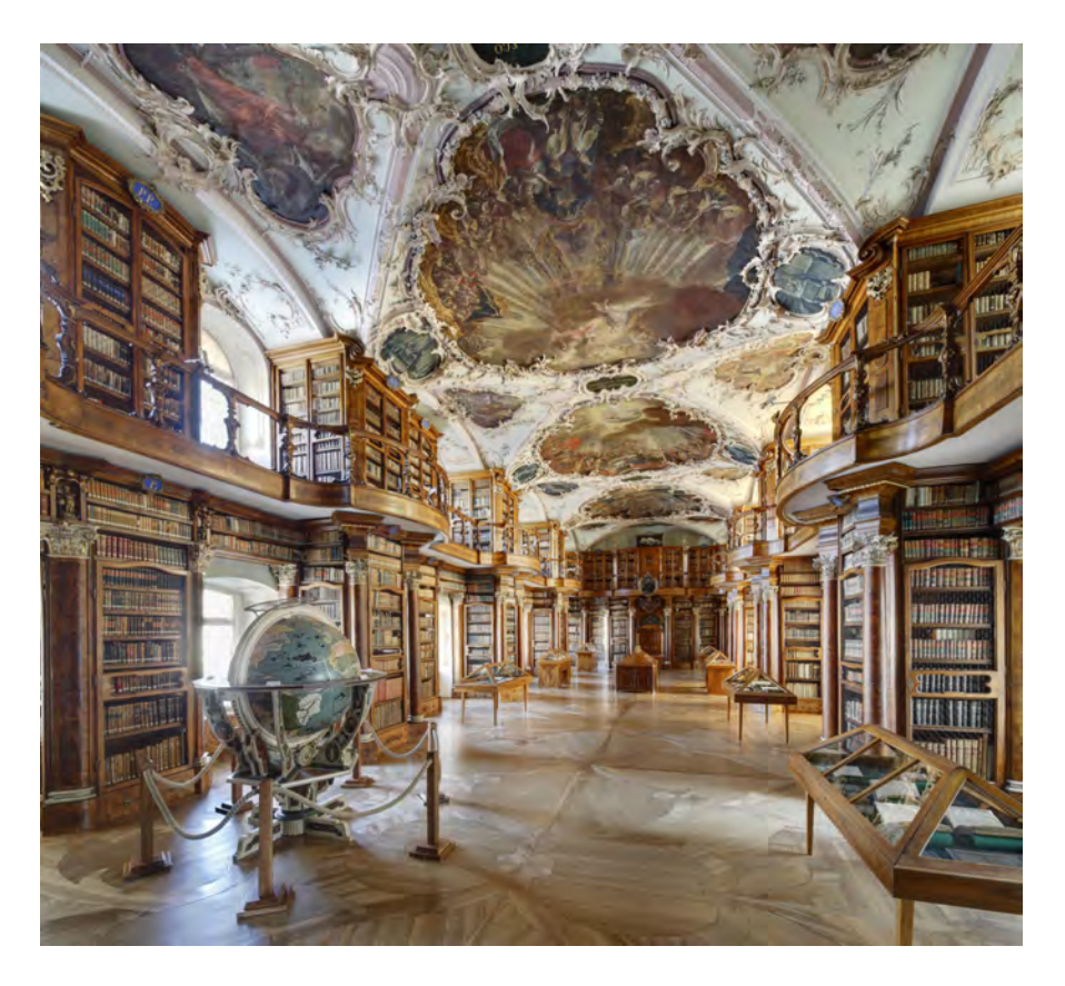
Image 1: The Baroque Hall of the Abbey Library of St. Gall in Switzerland

After the 16<sup>th</sup> century and into the period of the Enlightenment, the overall position and development of theological libraries were greatly influenced and affected by religious wars, censorship, and waves of secularizations that led their collections to be confiscated, suppressed, scattered, or destroyed.