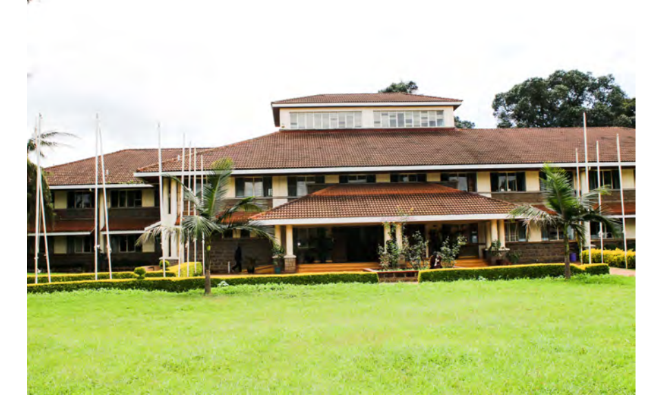
Image 1: Tony Wilmot Library of the Africa International University in Nairobi, Kenya.

relationship with the activities of the white missionaries who introduced Christianity to the continent. Generally, theological schools and Christian universities in Africa were established by churches or Christian mission boards. They mostly began as centers to train church ministers. Eventually, they developed into theological schools and universities.