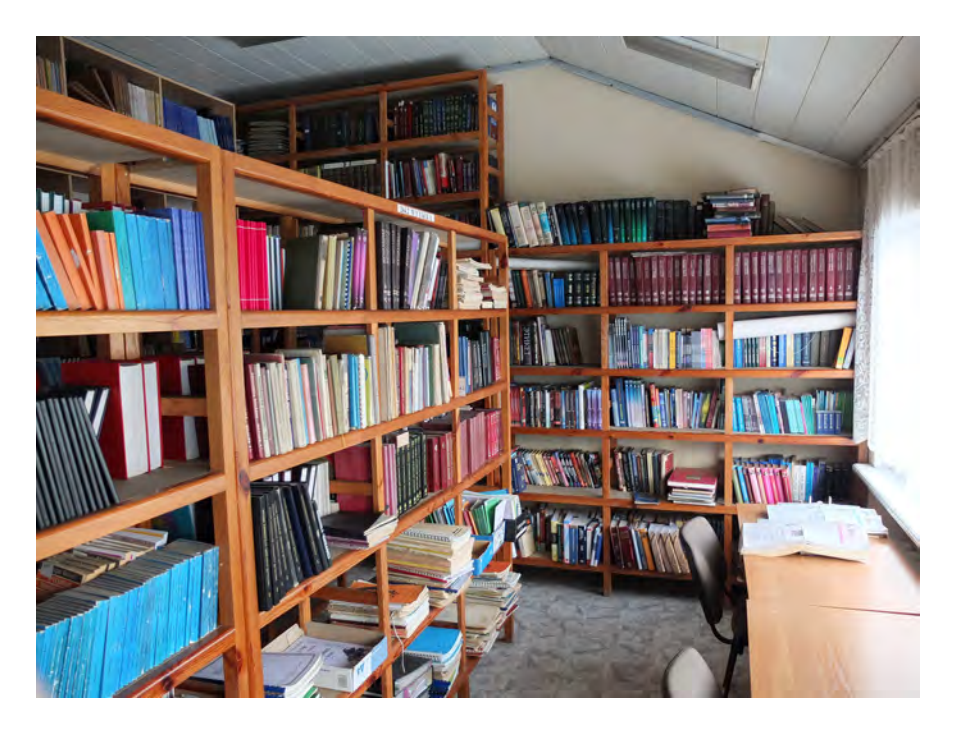
Image 5: The library of the Almaty Bible Institute in Kazakhstan.

Bishkek (United Theological Seminary with about 12,000 volumes; Baptist Bible Institute with about 5,000 volumes). Many training initiatives function 'under the radar' as underground seminaries, some are satellite campuses of theological schools from other post-Soviet countries, most use 'less visible' electronic resources instead of a physical library.