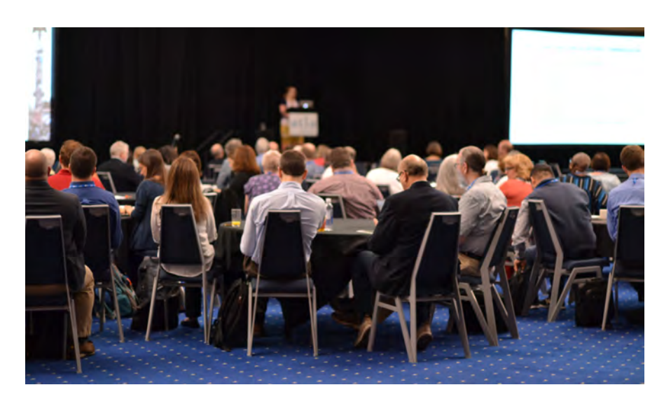
Image 3: Plenary session at Atla Annual 2019 in Vancouver, Canada.

Three interwoven strands came together to help Atla become the association it is today. The first was in the creation of Atla in order to strengthen the accrediting standards around library and information resources, increasing awareness of the lack of indexing in religious periodical literature, and finally came the work of recruiting qualified theological librarians to staff and fund quality theological libraries.