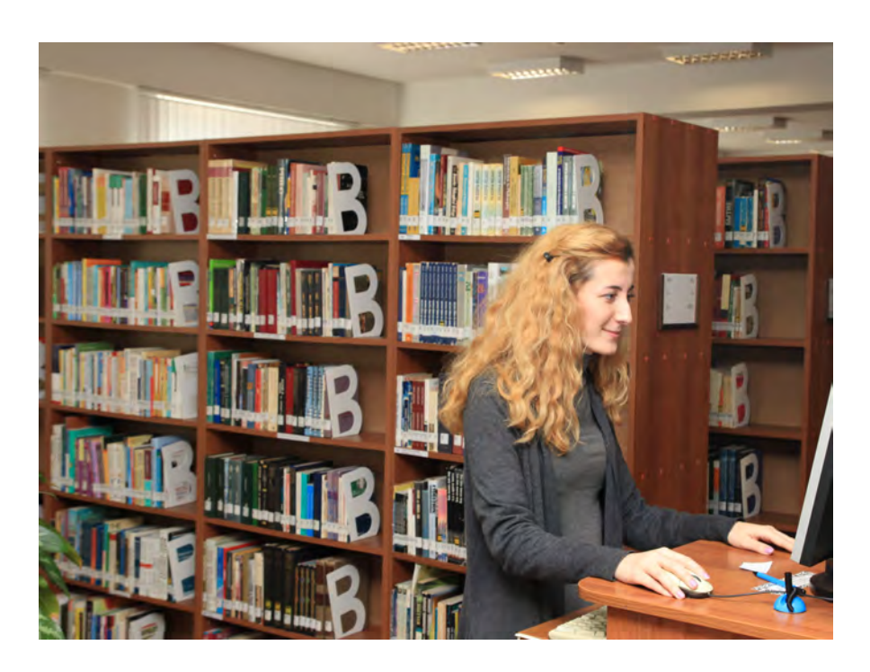
Image 4: The library of Divitia Gratiae University.