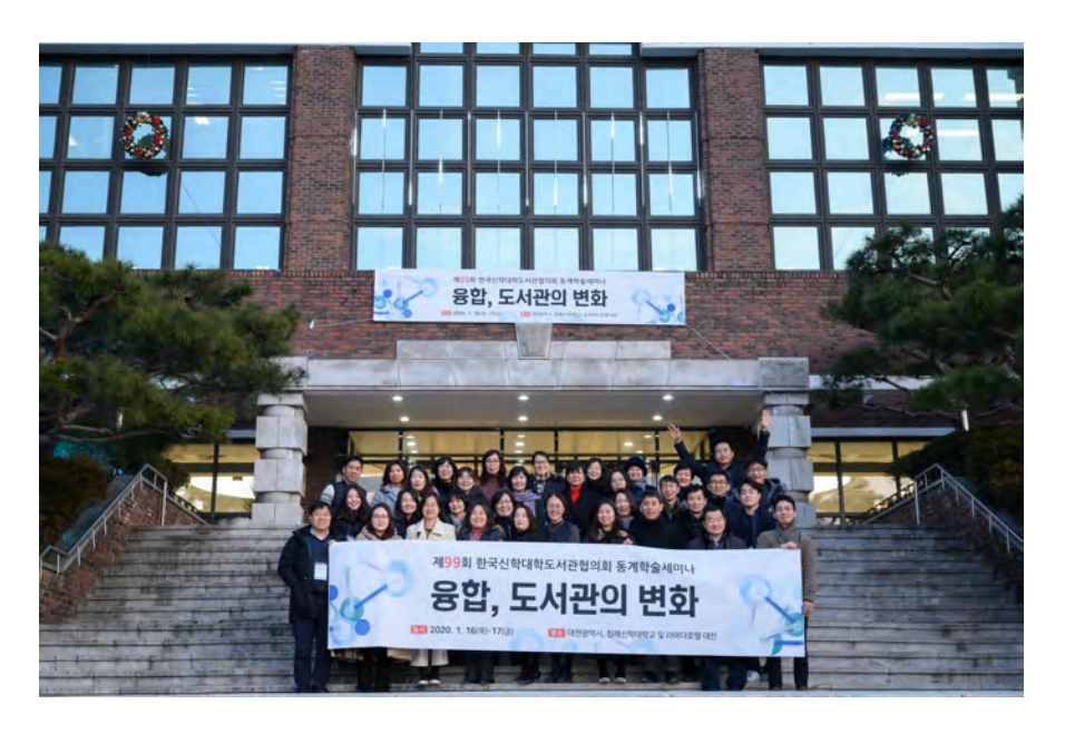
Image 3: 2019 KTLA Summer Academic Seminar Participants.