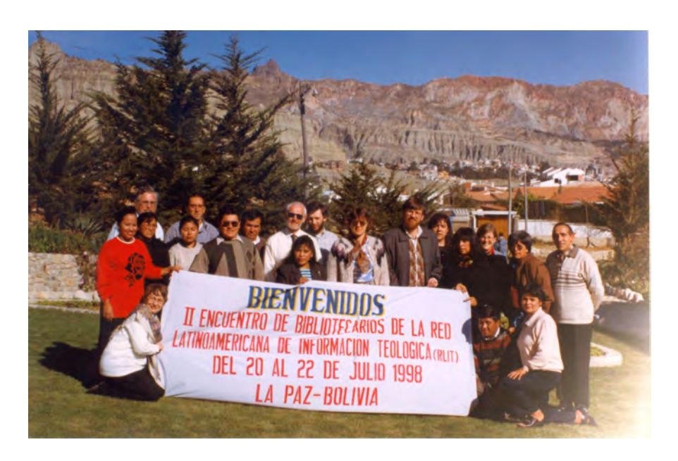
Image 2: Attendees at the 2<sup>nd</sup> Meeting of RLIT in La Paz, Bolivia, 1998.

Latinoamericana de Información Teológica–RLIT). This new organization met every two years in a different Latin America country (La Paz, Bolivia; Quito, Ecuador; Havana, Cuba; Mexico City; Buenos Aires, Argentina; Asunción, Paraguay). During these theological librarianship congresses numerous subjects were approached, such as: Latin American theological librarianship, Latin American theological development, Latin American theological professional needs, Latin American theological librarianship trends, theology and theological education, the theological library user, theological information services in Latin America, new information technologies, reference works in theological libraries, and practical experiences with library automation.