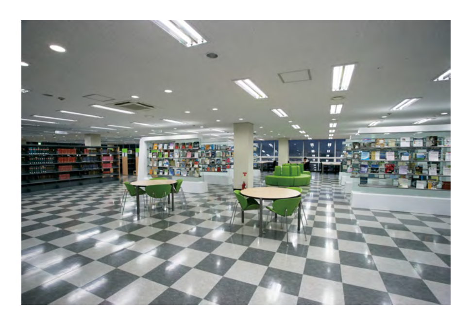
Image 2: Academic Information Center of SungKyul University.

Seminary Library, visited South Korea. Librarians from seminary libraries across the country were assembled. They had a meeting and agreed that a library union movement was necessary for the successful development of all library operations. After five subsequent meetings, the articles of association were drafted. The name of the association was designated as the Korean Theological Library Association and established in April 1973. After this association was founded, a seminar was held regularly. In addition, the KTLA was responsible for various kinds of publications and, as a result, the perception of the seminary library improved substantially.