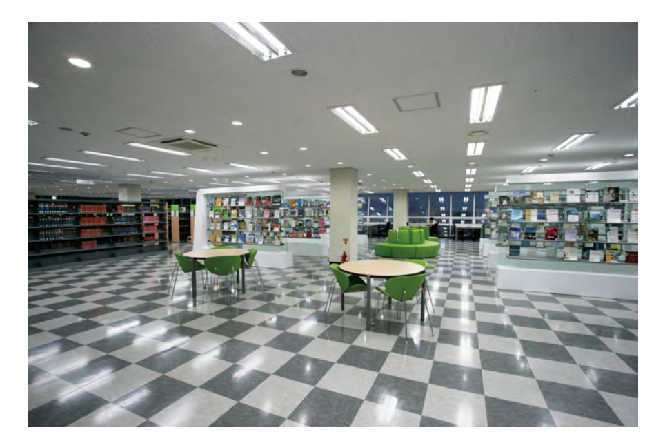
Image 2: Academic Information Center of SungKyul University.

Seminary Library, visited South Korea. Librarians from seminary libraries across the country were assembled. They had a meeting and agreed that a library union movement was necessary for the successful development of all library operations. After five subsequent meetings, the articles of association were drafted. The name of the association was designated as the Korean Theological Library Association and established in April 1973. After this association was founded, a seminar was held regularly. In addition, the KTLA was responsible for various kinds of publications and, as a result, the perception of the seminary library improved substantially.