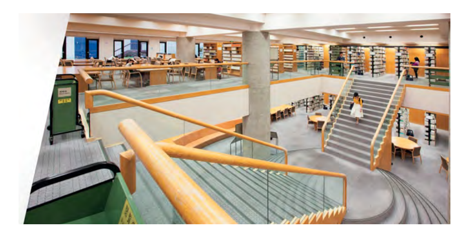
Image 5: Central Library of Sophia.