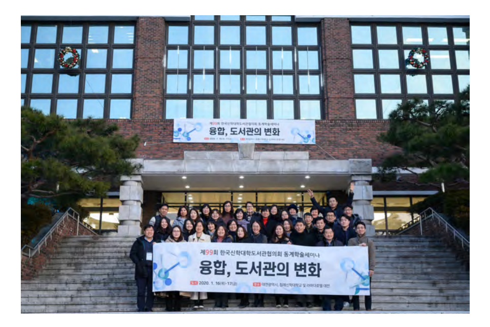
Image 3: 2019 KTLA Summer Academic Seminar Participants.