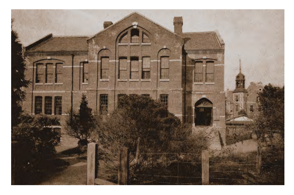
Image 4: The first library of Doshisha University (1914).

of the Central Library. Otherwise, as one of the research organizations, there is Kirishitan Bunko Library. This was founded in 1939 "with a mission to advance the study of the history of Kirishitan (early Japanese Christians) and the study of cultural exchanges between Japan and Europe." This library has more than 15,600 books in various languages.